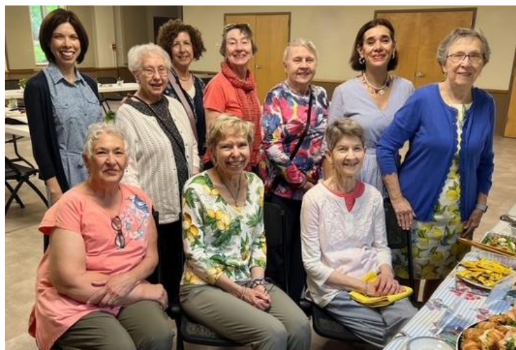
Interest Group Chairs Luncheon

Wine Club will hold a gathering at Top Ten Wines, on Wednesday, June 25 th at 5:30.